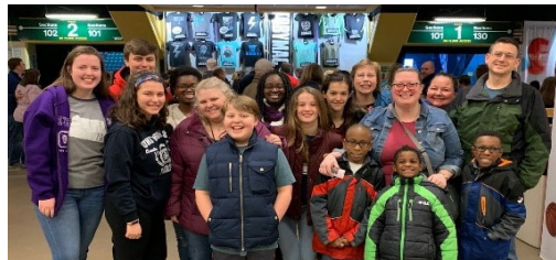
Youth, family and friends at Toby Mac!

Youth Group is for students who have completed confirmation or are in grades 7-12. This year the youth participated in Bible studies Not a Fan and The Fruit of the Spirit. This past spring the youth and other family members attended the Toby Mac concert at the Eagle Bank Arena. It was a great night of worship and fellowship!