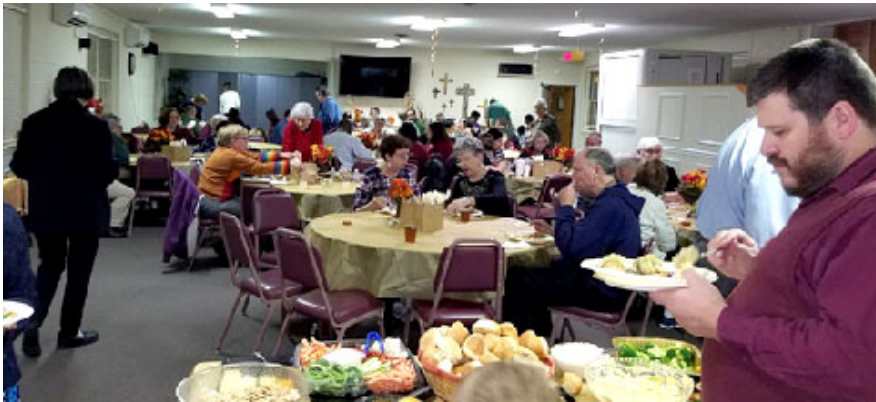
← 6 th Annual Community Thanksgiving Dinner was held on November 18, 2018 with 130 people in attendance. Cokesbury Hall rang with food and fellowship, as we gathered to give thanks for the Lord's blessings as a community.