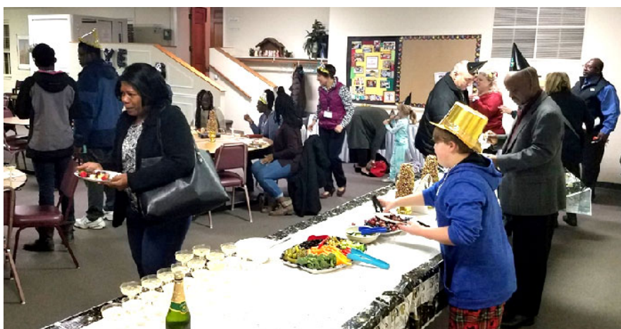
← Watch Night - December 31, 2018 Franconia UMC celebrated the 156 th anniversary of watch night. This year's celebration focused on having faith the size of a mustard seed. Following the service, participants gathered in Cokesbury Hall to watch the New Year's Eve ball drop and ring in the New Year with glad tidings, sparkling cider and snacks!