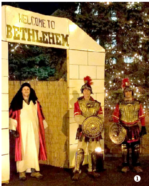
6 th Annual A Night in Bethlehem (photos, 1-4) was once again a community crowd pleaser and census takers counted 244 participants! 66 volunteers, 11 first-century shops and a live petting zoo including a camel and other friendly animals. See our full photo gallery at the FUMC FaceBook page.