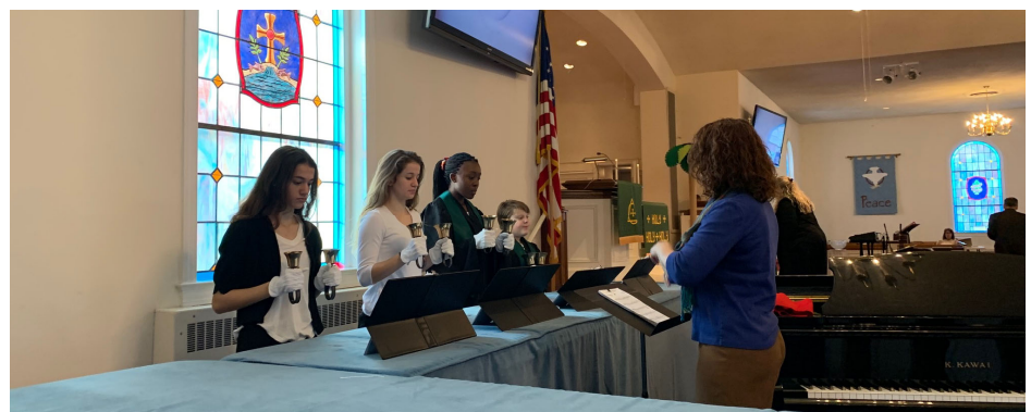
The FUMC Youth Bells provide music in worship - our music ministry is growing!